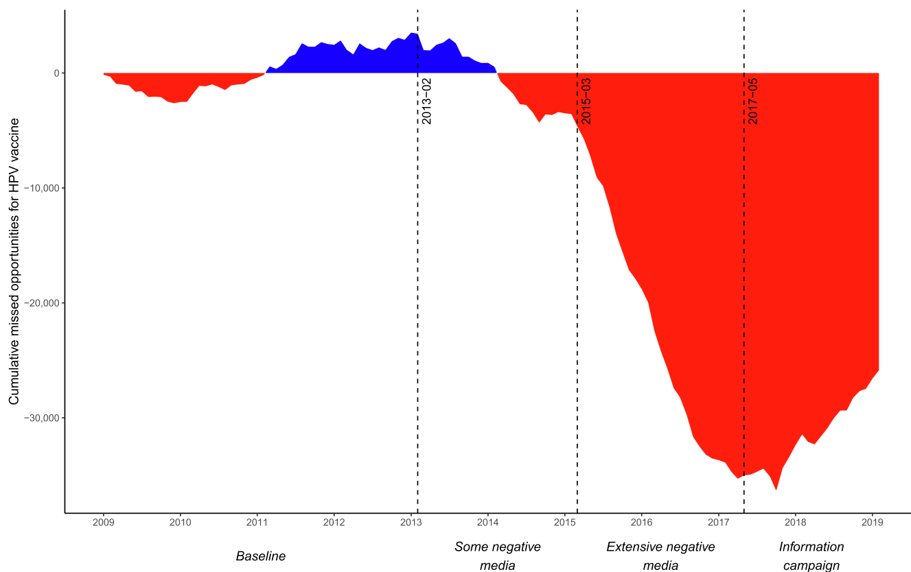
Fig. 3. Cumulative missed opportunities for HPV vaccine initiation in time periods defined by negative media coverage and national information campaign. Missed opportunities are relative to the average HPV vaccine initiation for birth year cohorts 1997–1999.

ties inadequately addressed. The media coverage may also have led people to attribute existing or new unexplained symptoms to vaccination [27]. Such an explanation is consistent with events in New Zealand where the volume of news articles on HPV vaccine was associated with adverse event reports [28]. Additional research is needed to understand the specific mechanisms through which unfounded safety scares undermine vaccine uptake, including the role of Denmark's decision early on to pay several people for harms they attributed to HPV vaccination [29].